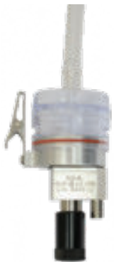
HD style cyclone with US style cassette is specified in numerous NIOSH protocols

The Gilian BGI-4L is a Higgins-Dewell style aluminum cyclone that operates at 2.2 LPM to produce a 50% cut at 4 microns per the US-ACGIH size distribution curve. This style cyclone is specified in NIOSH 0600 and other respirable dust methods as an alternative to the 10 mm nylon cyclone. It is used with 37 mm, 5 micron, PVC, 3-piece NIOSH-style filter cassettes. The GilAir Plus and Gilian 5000 pump models are recommended.