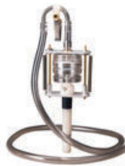
10 mm nylon cyclone is used in NIOSH & OSHA sampling methods.

The traditional personal air sampling cyclone in the US is the Dorr-Oliver, 10mm nylon cyclone. It was first utilized in US coal mines in the early 1960's, and it continues to be the most commonly used model in the US. It will follow the US ACGIH size distribution curve (50% cut at 4 microns) closely when used at 1.7 LPM. This cyclone is specified in numerous NIOSH and OSHA Test Methods for use with 37mm, 5 micron, PVC, 3-piece filter cassettes. The GilAir Plus and Gilian 5000 pump models are recommended for use with this cyclone. Calibration jar P/N 7013376 (2 Liter size) is also recommended.