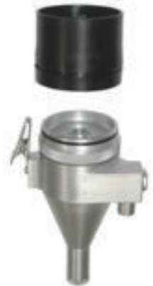
RASCAL Cyclone with standard plastic filter holder

The Gilian RASCAL (Respirable Air Sampling Cyclone, Aluminum, Large), made in the US, follows the ACGIH particle size distribution curve (50% at 4µm) at flow rates between 8.5 and 9.5 LPM, per NIOSH Report ECM/2011/03. It is ideal for use with the Gilian 12 air sampling pump for larger volume sampling per the OSHA silica standard. The high flow rate range optimizes the sensitivity for respirable dust and respirable silica dust measurements. The RASCAL is used in conjunction with a 47 mm diameter, 5 micron pore size, PVC filter membrane.