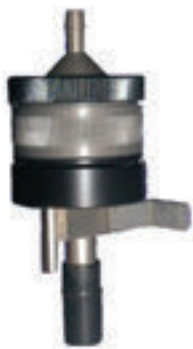
HD style cyclone with European style sampling cassette.

Identical in function to our BGI-4L Higgins-Dewell style cyclone, this Higgins-Dewell style cyclone incorporates two different styles of European filter cassettes and holders. It is ideal for respirable dust sampling according to HSE MDHS 14/3 (UK) at 2.0 LPM (50% cut at 5 microns). In that sampling method glass fiber filters and MCE filters are recommended, depending upon the application. The GilAir Plus and Gilian 5000 pump models are suggested for use with this cyclone.