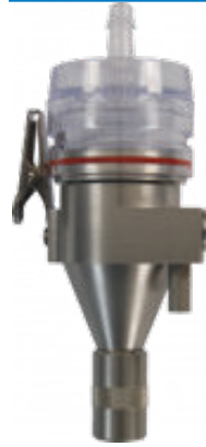
GK 2.69 Cyclone can be used for respirable or thoracic sampling.

The GK 2.69 respirable dust cyclone operates at 4.2 LPM to follow the US-ACGIH respirable dust size distribution curve with 50% cut at 4 microns. It can also be used at 1.6 LPM to follow convention for thoracic dust sampling with a 50% cut at 10 microns. It also uses 37 mm, 5 micron, PVC, 3-piece NIOSH style cassettes. An alternate version using 25mm cassettes is also available. The Gilian 12 sampling pump is recommended for respirable sampling. The GilAir Plus and Gilian 5000 pump models are recommended for thoracic sampling.