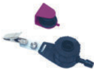
UK style Inhalable Dust Sampler with reusable 25mm cassette.

Inhalable dust sampling may be conducted at 2.0 LPM using this European style sampling head following HSE MDHS 14/3 (UK). In that sampling method glass fiber filters and MCE filters are recommended, depending upon the application. This unit incorporates a 25 mm reusable cassette.