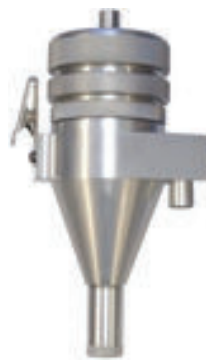
RASCAL Cyclone with Optional Aluminum Filter Holder